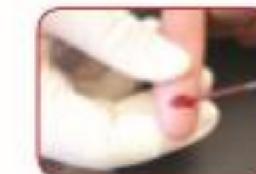
Blood Sample Preparation