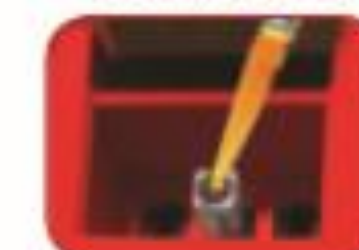
After 2 min add 75 µL of R2