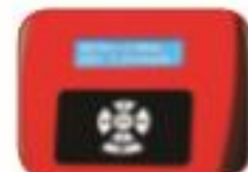
Record the result