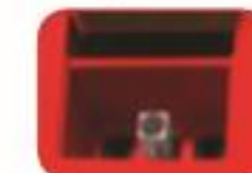
Locate in reading location & press enter